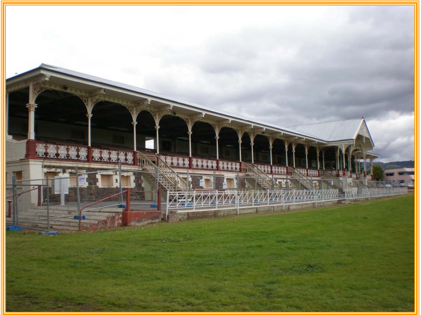
Victoria Park Grandstand Restoration